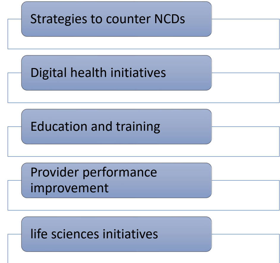
BHP's areas of support (2020)